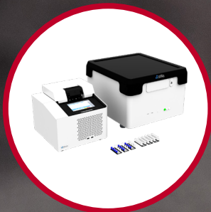
Digital PCR Solutions

Contact our Product Specialist Karen Moule at karen.moule@dksh.com or +61 439 712 030 for more info.