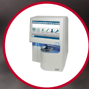
Cell Culture Analysers