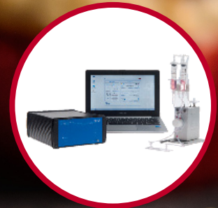
Live Cell Imaging