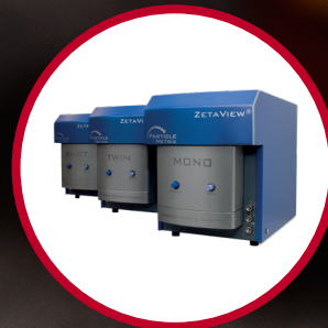
Nanoparticle Tracking Analyser