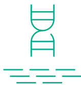
Whole Genome Sequencing