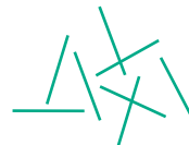
Gene Fragment & Oligo Synthesis