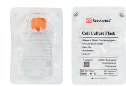
Individually Packed Flasks