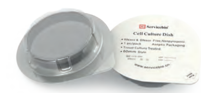
Individually Packed Dishes